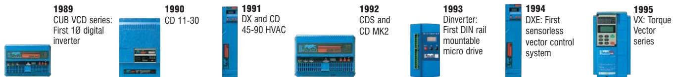
1989 CUB VCD series: First 1Ø digital inverter

IMO Jaguar. The technology... the support... the drive.