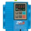
1996 VXS: Compact low cost Torque Vector series