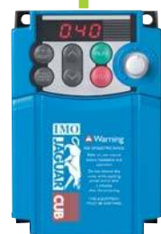
2004 CUB: 1Ø and 3Ø series