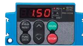
Additional CUB Keypad