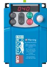
2004 CUB: 1Ø and 3Ø series