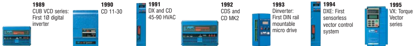
1989 CUB VCD series: First 1Ø digital inverter

IMO Jaguar. The technology... the support... the drive.