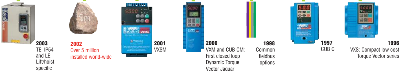
2003 TE: IP54 and LE: Lift/hoist specific

The only inverter in the world to underwrite your Energy Saving!