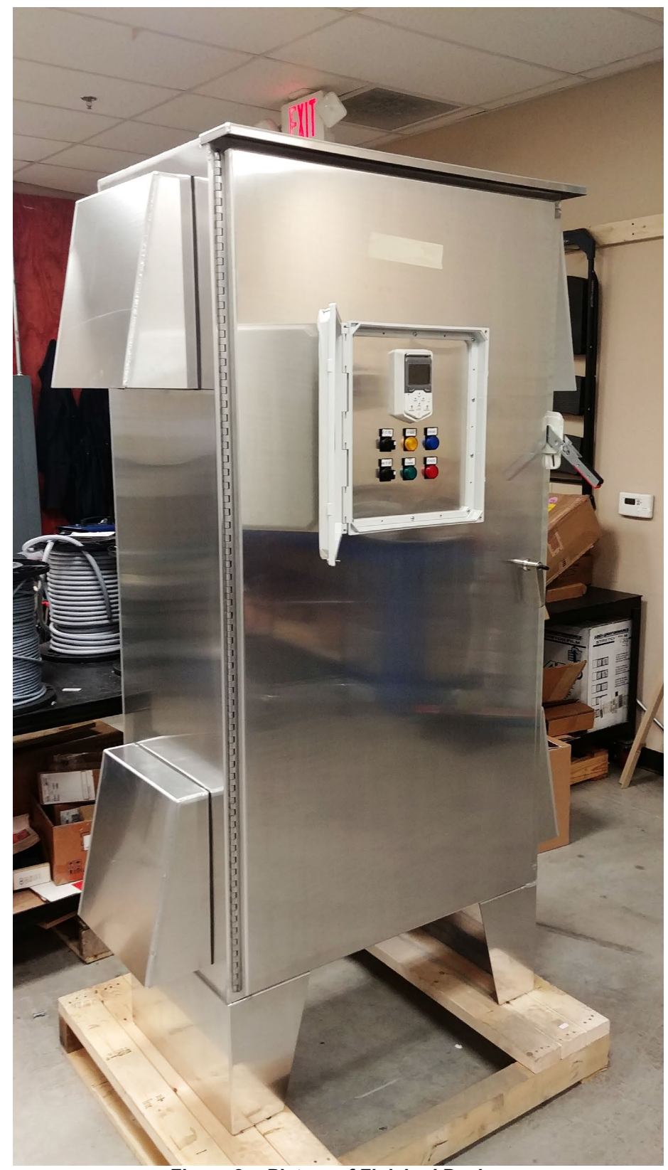
Figure 2 -- Picture of Finished Design